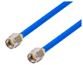
Generic photo used for illustration purposes only