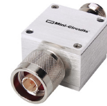
Generic photo used for illustration purposes only CASE STYLE: H795-4