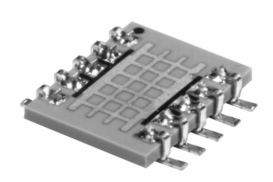
Fig 1: LTCC Power Splitter

LTCC quadrature splitters present a major technological advance by offering improvements in performance, size, power handling capability, and temperature stability. In addition, availability is off the shelf and they are price competitive for both military and commercial environments.