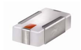
CASE STYLE : FV1206-4

Please click "Back", and then click "Contact Us" for Applications support.