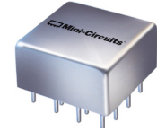
CASE STYLE: C07