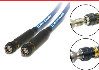
CASE STYLE: GM1530-XX