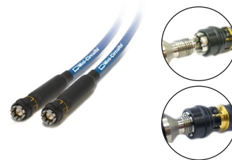
CASE STYLE: GM1530-XX