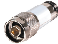
CASE STYLE: FF779