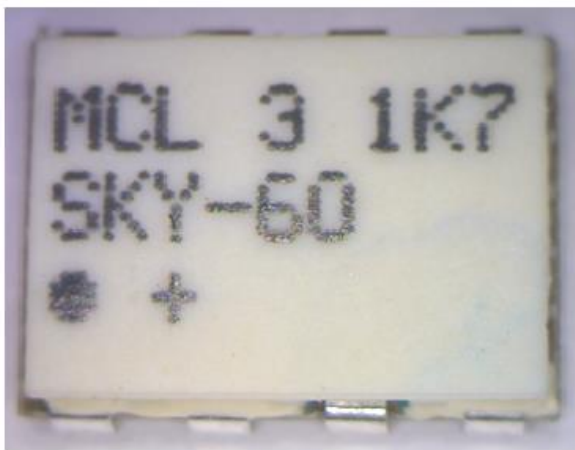
Top view ( Picture - 1 )