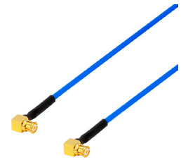
CASE STYLE: BZ2421HXX