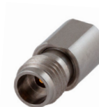
CASE STYLE: LL2592-1