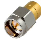
CASE STYLE: LL2699