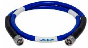
Generic photo used for illustration purposes only