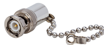
Generic photo used for illustration purposes only