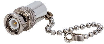
CASE STYLE: LL1188