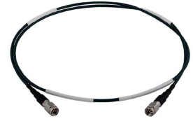
CASE STYLE: RF2512-3.28