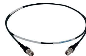
CASE STYLE: RG2513-2