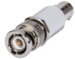
Generic photo used for illustration purposes only