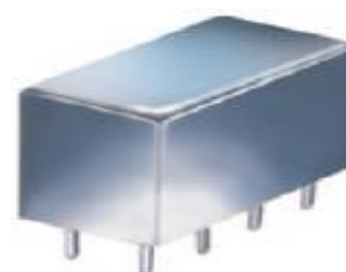
CASE STYLE : A01

Please click "Back", and then click "Contact Us" for Applications support.