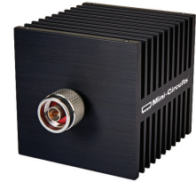
Generic photo used for illustration purposes only