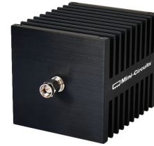
CASE STYLE: LL2798-1