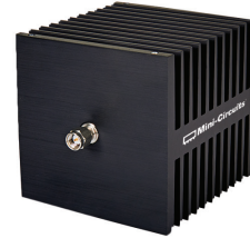
CASE STYLE: LL2798-3