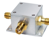
CASE STYLE: V37