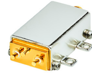
Generic photo used for illustration purposes only CASE STYLE: GB956