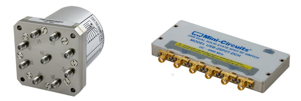
Figure 1. SP8T electromechanical switch, MSP8T-12D+ (left), and dual SPDT solid state switch, USB-2SP2T-DCH (right). No single switch design meets all test needs. Tradeoffs are often required on performance, speed, and number of switching cycles.

Solid state switches, by contrast, tend to have much faster switching speeds and better repeatability over a greater number of switching cycles. These attributes are especially desirable for high-volume production test applications, as switching speed is directly related to test throughput, and the switches need to be replaced far less often under heavy use. At the same time, they come with limitations of lower power handling and lower isolation. Isolation in particular is more difficult to calibrate out of a test system and is therefore an especially critical parameter for automated testing. Switches with poor isolation can allow stray signals to flow into the measurement path and degrade the integrity of the measurement. This can impair system accuracy and lead to challenges in determining uncertainties and timing requirements.