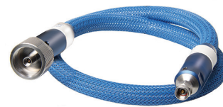
CASE STYLE: NE1922-2.1