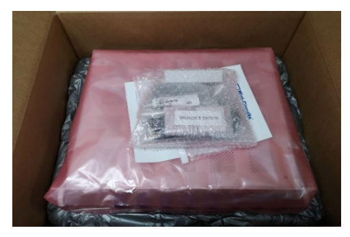
Step 3: Remove the equipment from the package along with the protective foam inserts. Set it down onto a secure surface.