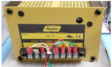
Power supplies shown for reference. Your equipment contains one of the above.