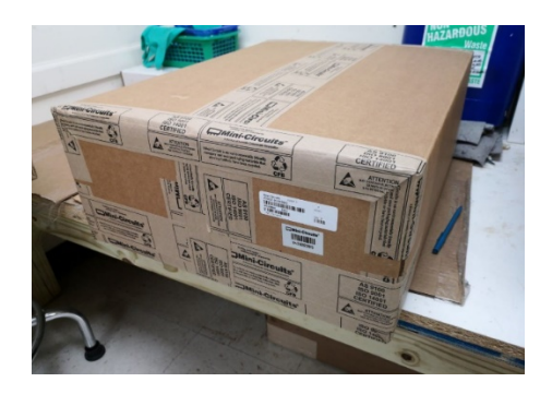
Step 1: The equipment is shipped in a large package, pictured above.