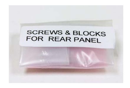
Figure 4: Safety Blocks come in a clearly labeled plastic bag

Units of 2U height and greater come supplied with four rear-panel safety blocks to prevent impact to delicate equipment. These must be installed by the customer on the rear panel of the product before use. Failure to install safety blocks may result in damage to the product.