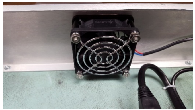
Figure 2: Fan blades inside the equipment case