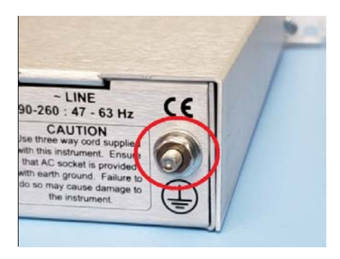
Figure 6: Rear Panel Grounding Stud

The rear panel of the unit is constructed with a #10-32 \times \frac{1}{2} " long grounding stud to ground the box.