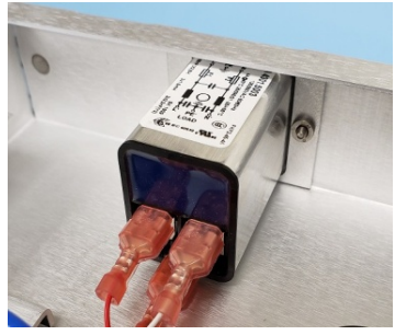
AC Power Entry

This equipment may contain live 110/220V contacts and should be used and handled only by qualified professionals. When performing any activity in and around the box, user must exercise extreme caution to avoid touching any parts where live voltage may be present to prevent injury or death due to electrical shock.