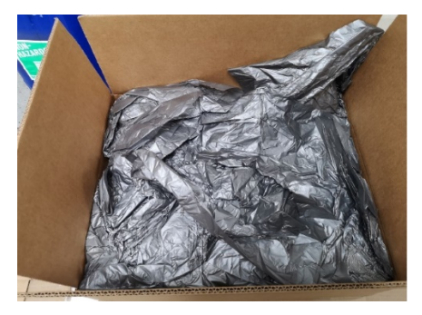
Step 2: Open the inner package and remove any excess packing material to expose the unit.